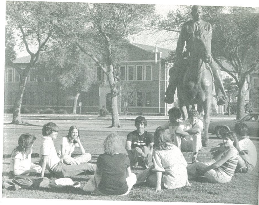
Taking a brief afternoon break at the Region I meet in Lubbock are these UIL contestants from Kermit High.